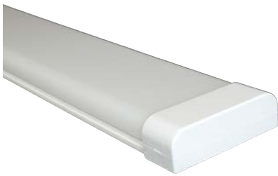
Low Profile Design