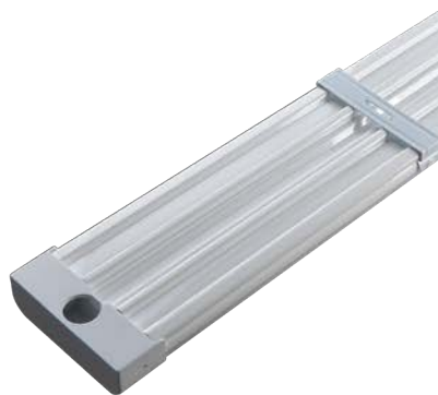
Cable Access and Mounting Brackets